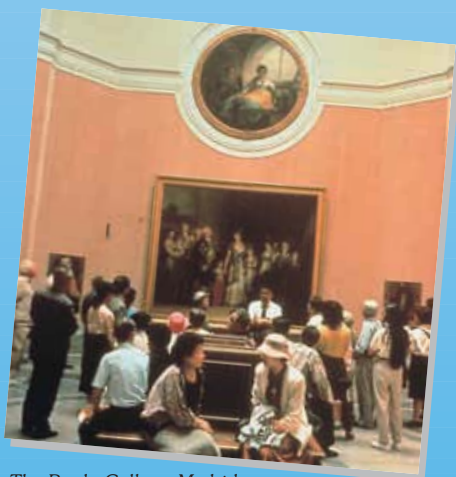
The Prado Gallery, Madrid