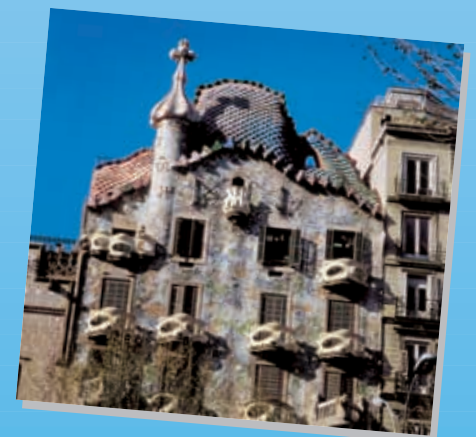
Barcelona. Casa Batlló

It includes air Ticket Barcelona-Palma-Madrid or Barcelona . This extension must be sold together with tour Route of the Mediterranean.