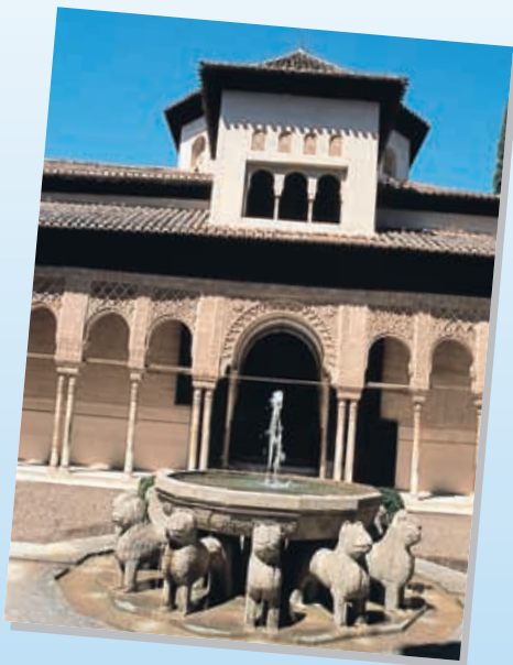
Granada: Alhambra Palace