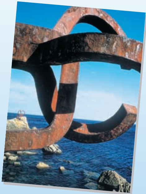
Comb of the winds sculpture by Eduardo Chillida