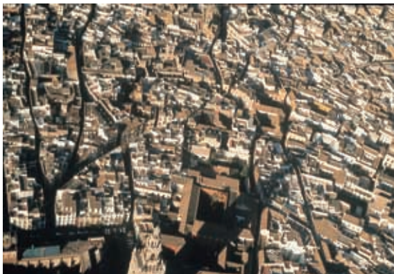
Sevilla. The old quarter from the air