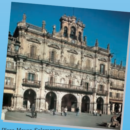
Plaza Mayor, Salamanca