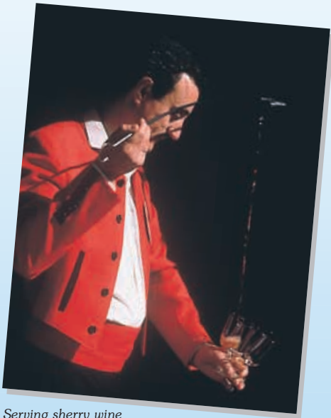
Serving sherry wine