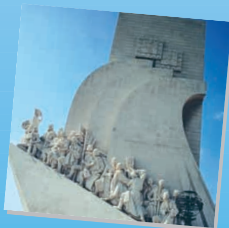
Lisbon. Monument to Navigators