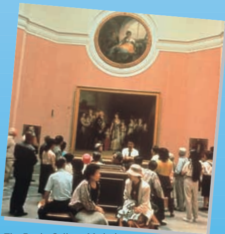
The Prado Gallery. Madrid