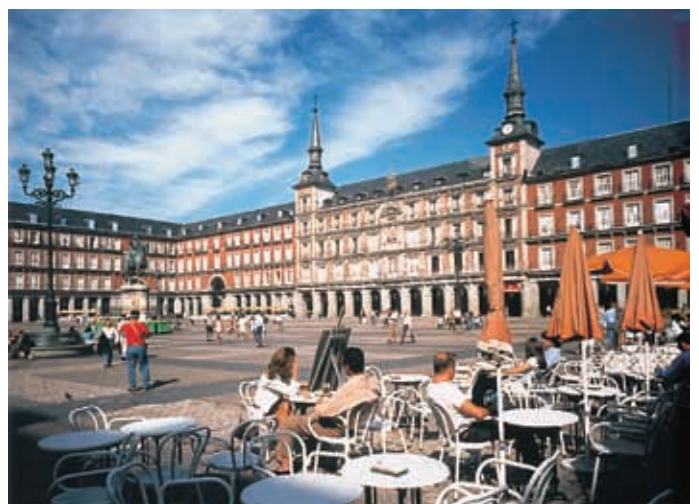
Madrid. Plaza Mayor

Ask for our special low season prices (Nov'2007 through Mar'2008). Prices are not valid during Trade Fair periods and Easter .