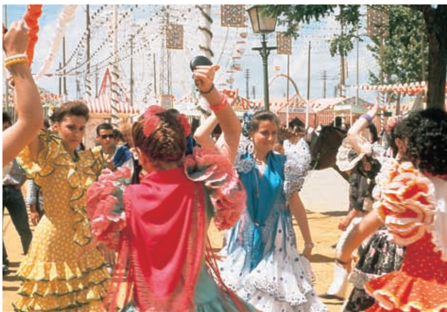
Sevilla. April fair