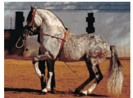
Spanish horseback riding school