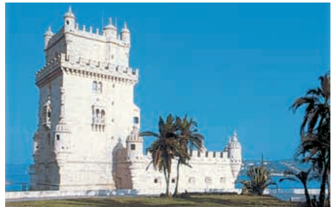
Lisbon. Belem Tower