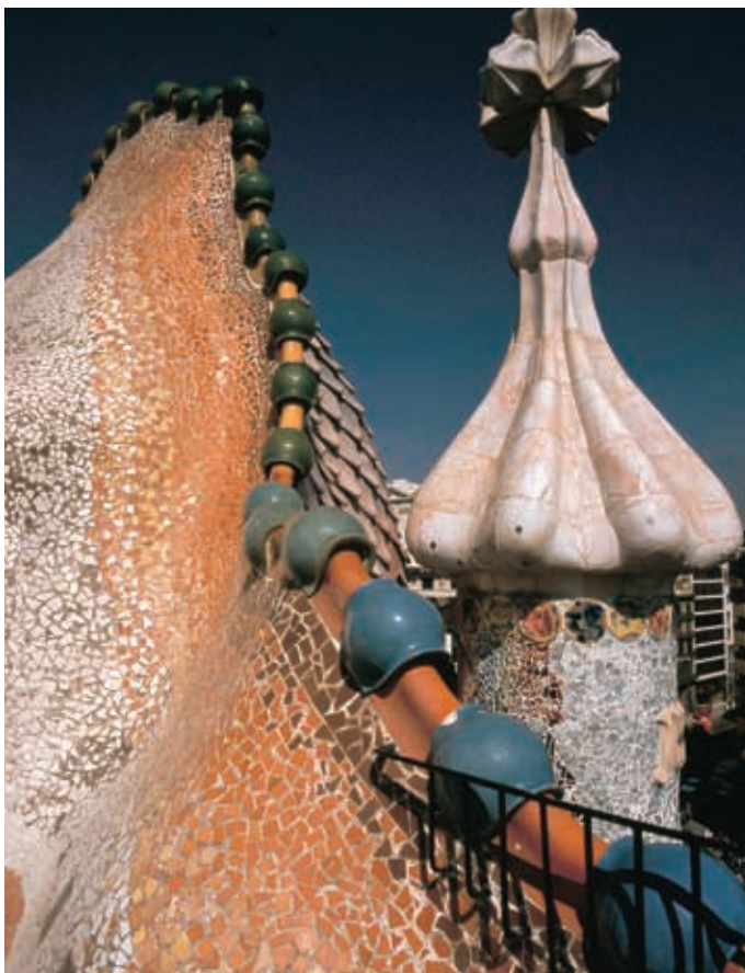
Barcelona. Casa Batlló by Gaudí