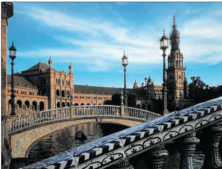
Plaza de España. Sevilla