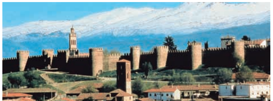
Avila. Walls and mountains