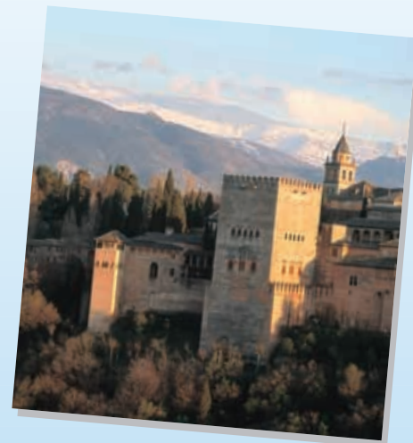
Granada. The Alhambra Palace