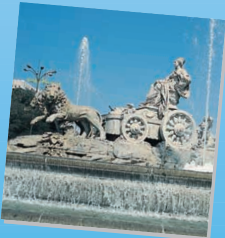
Madrid. Fountain of La Cibeles