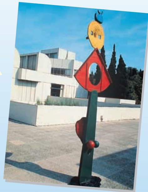
Miro's Gallery in Barcelona