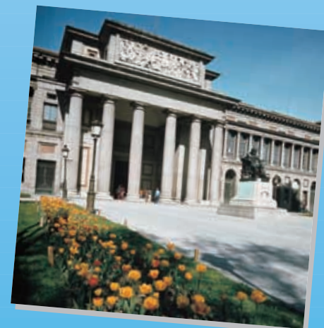
Madrid. The Prado Museum